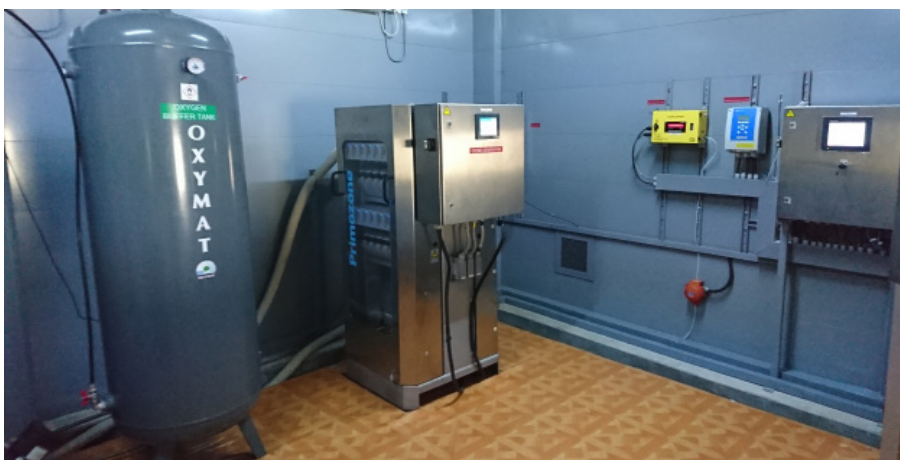
Primozone ozone installation at Yoma Strategic Holdings Limited, Myanmar.