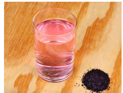
Pile of permanganate crystal and pink coloured water.